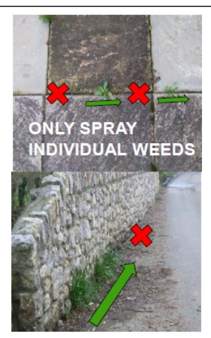
CAUTION: When operating manually, do not stop and treat each individual weed with the standard dilution as this will result in overdosing. The trigger/switch should be turned on and off whilst continuing to walk.

You can spray weeds in a 30cm swath across the kerb edge to include any weeds growing in the gutter on the road side